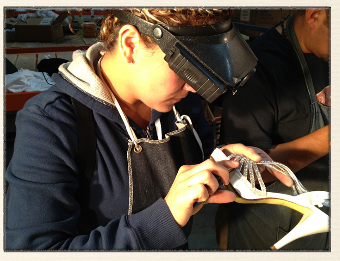
Repairing rhinestones on bridal shoes