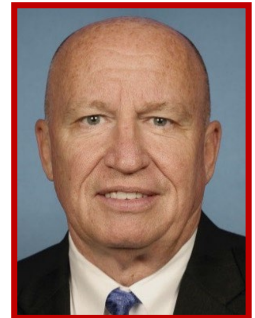
Kevin Brady (R-TX) Ranking Member House Ways & Means