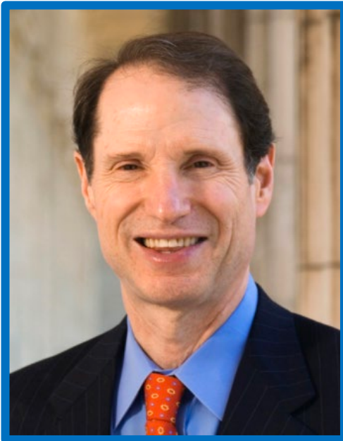
Ron Wyden (D-OR) Chair Senate Finance