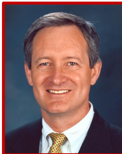
Mike Crapo (R-ID) Ranking Member Senate Finance