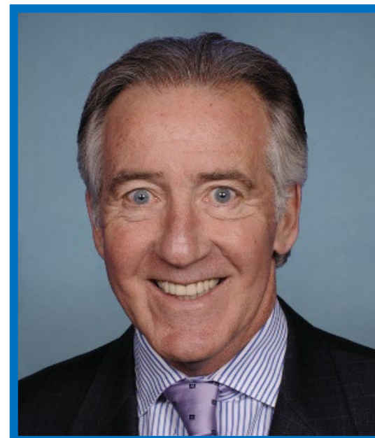
Richard Neal (D-MA) Chair House Ways & Means