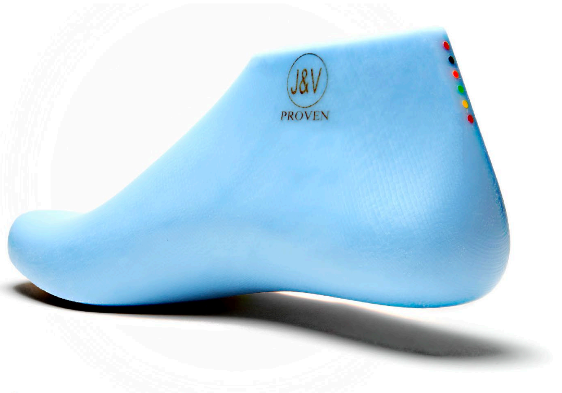
Fine Turning to precise measurements.