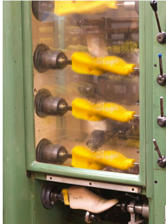
Mechanical Last Production

Introduced Compu-Last® — data-driven Last manufacturing