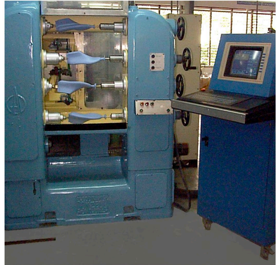
Digital CompuLast Production