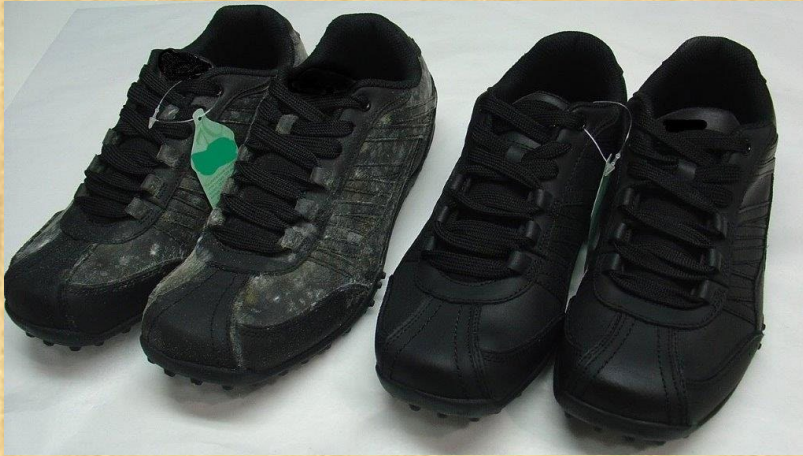
Mold, Mildew and Odor Remediation