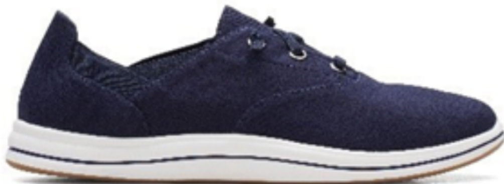
Recalled Clarks women's shoes- Breeze Ave (dark navy-article 26165269)