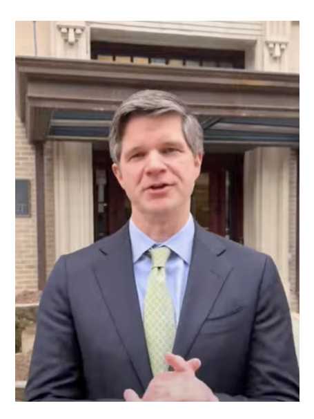
Recap: hearing takeaways

Go deeper : Watch Matt's video recap <u>here</u>: