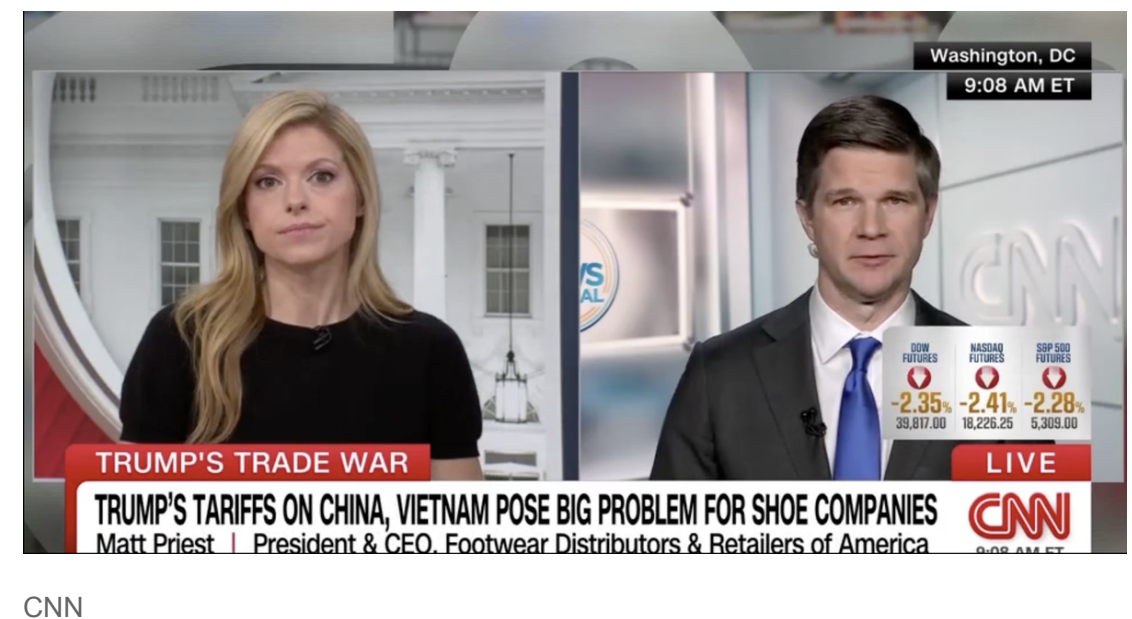
. . . . .